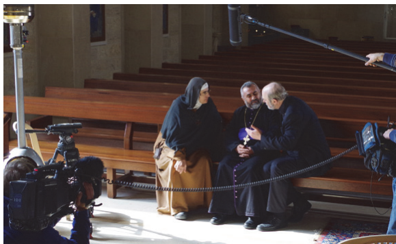
During shots in Lebanon

knowledge and also the sympathy for traumatized refugees shown by the filmmakers: "This will be a truly solid documentary, suitable for Good Friday, which sets a high standard for television productions." Schirmmacher consults with the Central Council of Oriental Christians in Germany, which helped to arrange many of the interviews for the documentary.