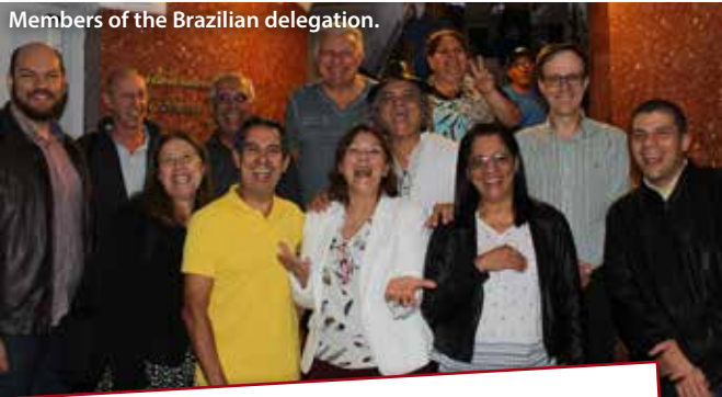
Members of the Brazilian delegation.

A further series of internal challenges highlighted the inclination of Pentecostal churches to embrace conservative positions with regard to the role of the church, church leaders indulging in quests for power in numbers, denying women the access to ministry and leadership, and, ignoring accountability for administrative and spiritual authority.