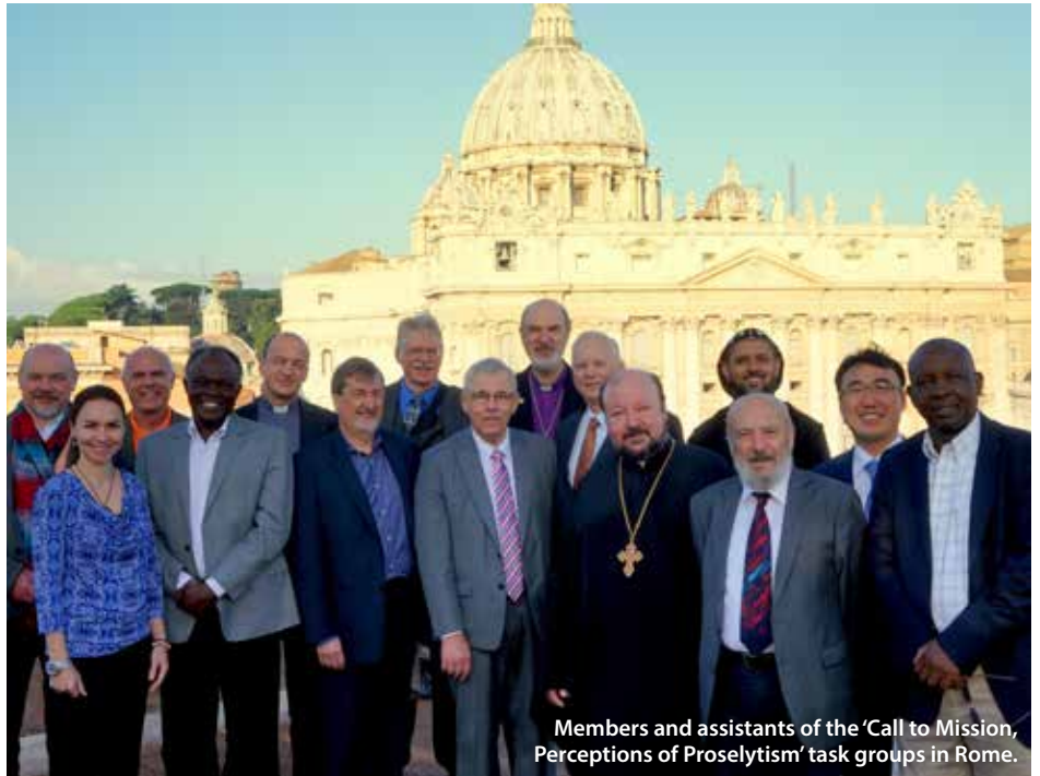
Members and assistants of the 'Call to Mission, Perceptions of Proselytism' task groups in Rome.