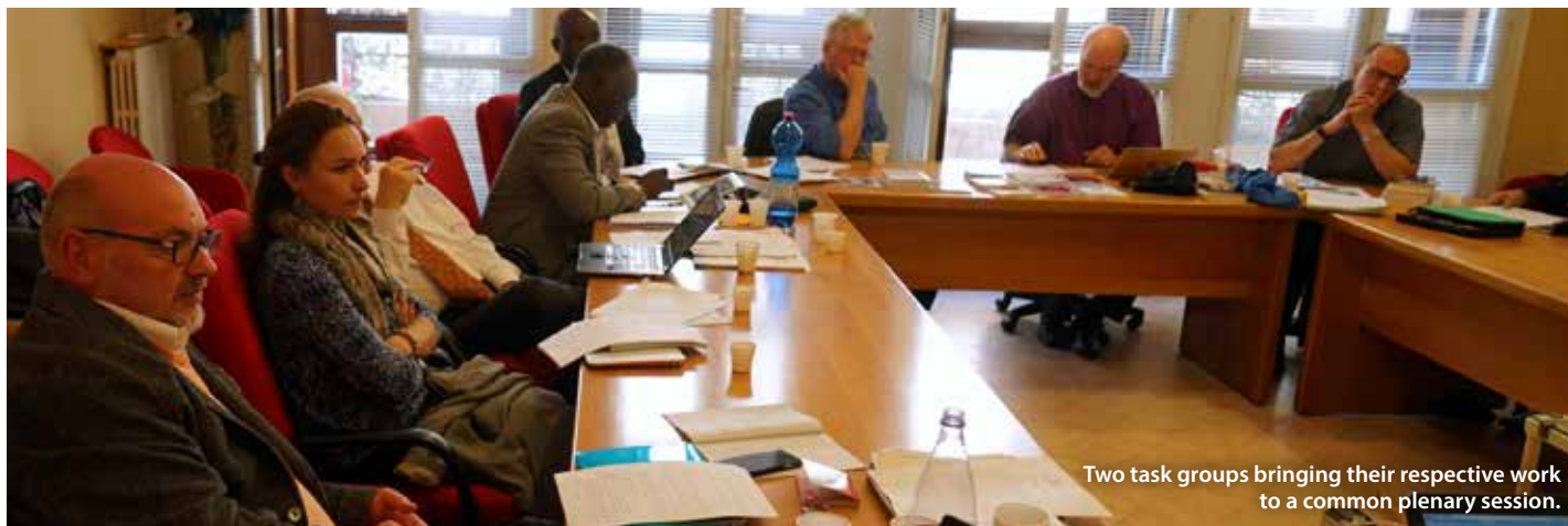
Two task groups bringing their respective work to a common plenary session.