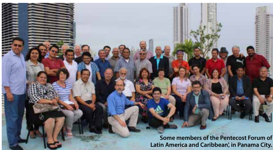
Some members of the Pentecost Forum of Latin America and Caribbean, in Panama City.