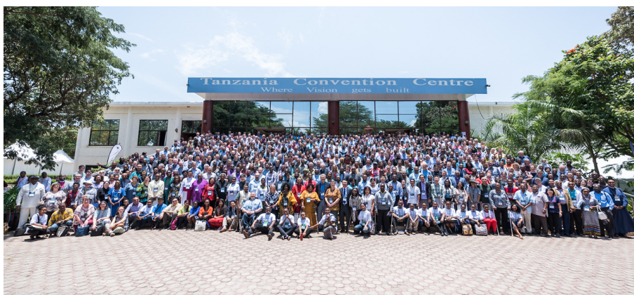
All 1,000 or so conference participants managed to fit into this picture!

It was refreshing to see a deliberate emphasis on developing younger leaders, partly because a Global Ecumenical Theological Institute programme took place during the days immediately before the main conference, with many young theologians participating. Indeed, the speakers who made the biggest impressions on everyone I spoke with were young women.