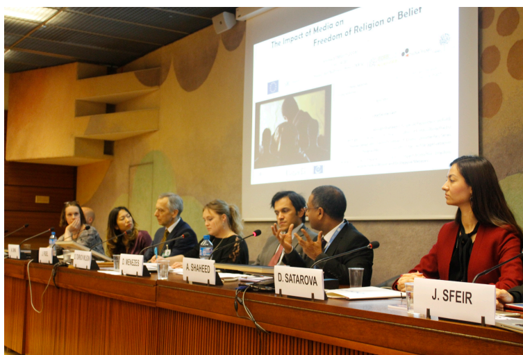
The panel at the launch of the FORB Learning Platform

A second series of four short videos on 'Access to Justice' is also available.